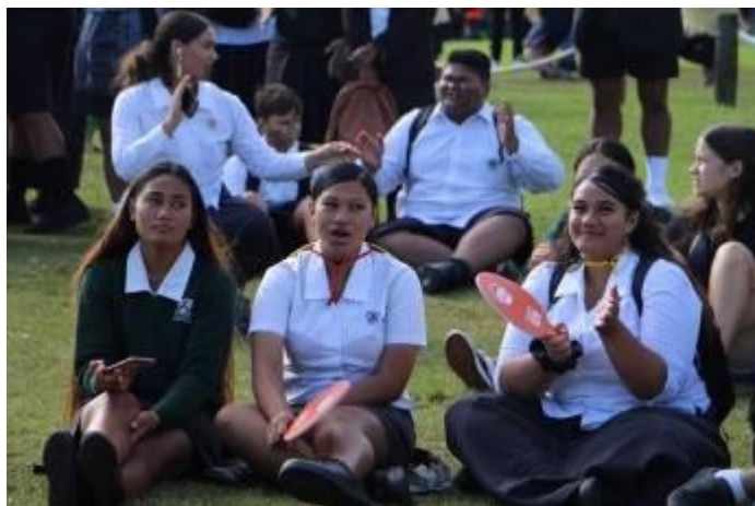
Left: Some of our fantastic supporters!